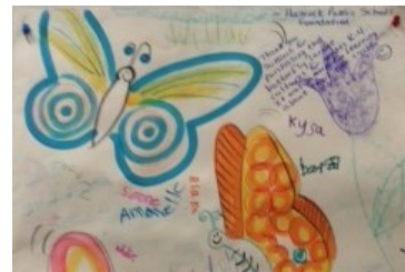
Beautiful thank you card from students

As part of their science curriculum, students in Grades K-4 studied the life cycle of the Painted Lady Butterfly from pupation to adulthood.