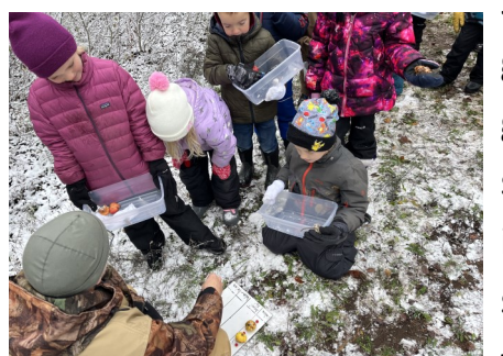
Second graders gather seeds in our school forest