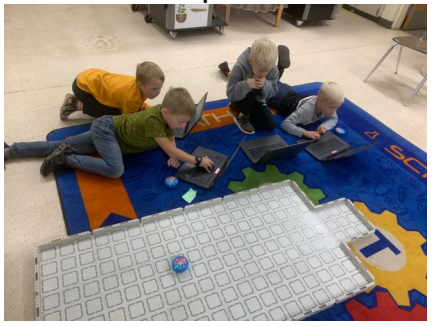
Second graders work on their coding skills