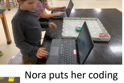
skills to work